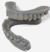
9 min 11 Clear Aligner Models