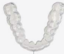
49 min 8 Splints