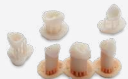
18 min Over 100 crowns

Dentistry made easier through innovative solutions.