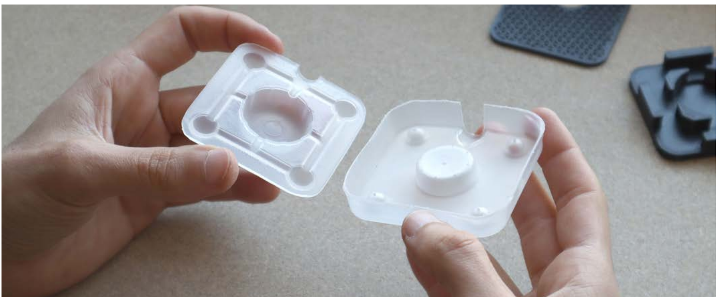
Both elements of a 2-part mold used to create a button.