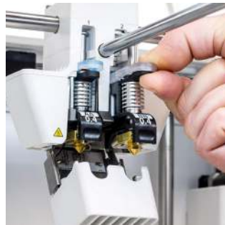
Print core BB Quick-swap nozzles for build and water-soluble support materials. Available in 0.25, 0.4, and 0.8 mm