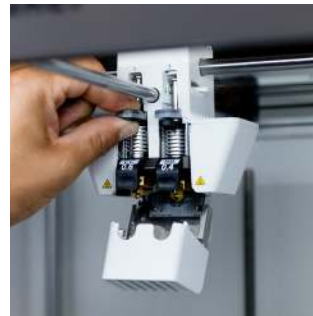
Print core CC Ruby-tipped for printing abrasive glass and carbon fiber composites. Available in 0.4 and 0.6 mm