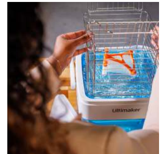
PVA Removal Station Remove water-soluble PVA support material up to 4X faster