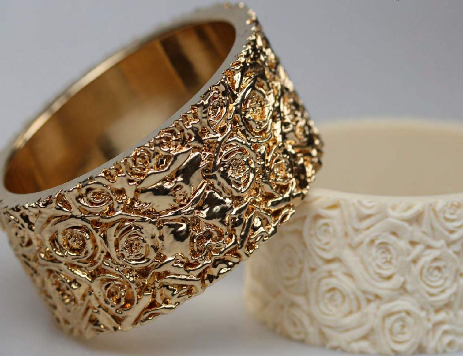
"Rosaspina" Bracelets Francesca Gabrielli Design