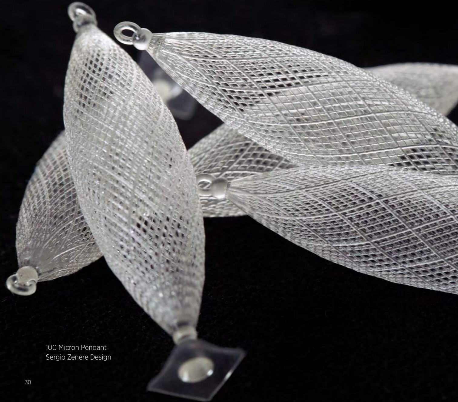
100 Micron Pendant Sergio Zenere Design