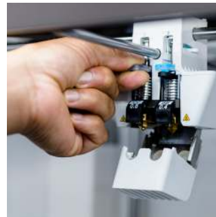
Print core CC 0.6 mm Ruby-tipped for printing abrasive composites