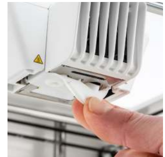
Nozzle covers x10 Replacement covers keep your print head in top condition