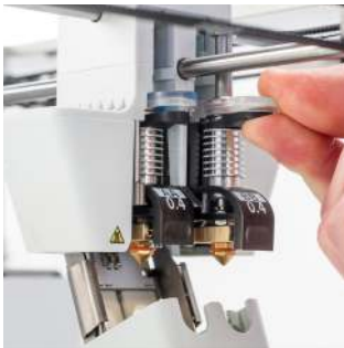
Print core AA 0.25, 0.4, 0.8 mm Quick-swap nozzles minimize downtime