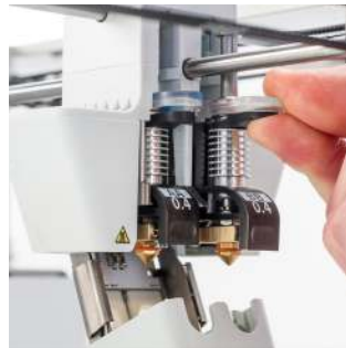
Print core BB 0.4, 0.8 mm Specially designed for printing soluble support material